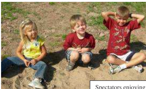
Spectators enjoying the outdoors