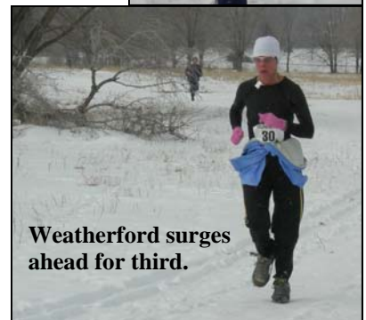
Weatherford surges ahead for third.

after the last single-track section across the dam.